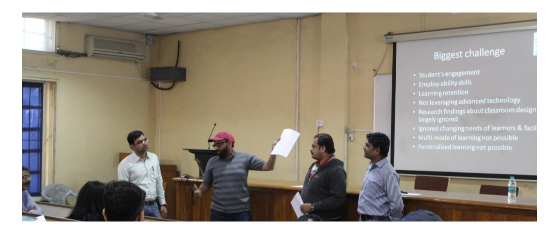
Team members explaining their improvised idea