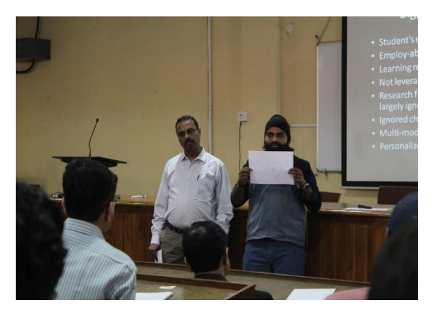
Team members explaining their improvised idea