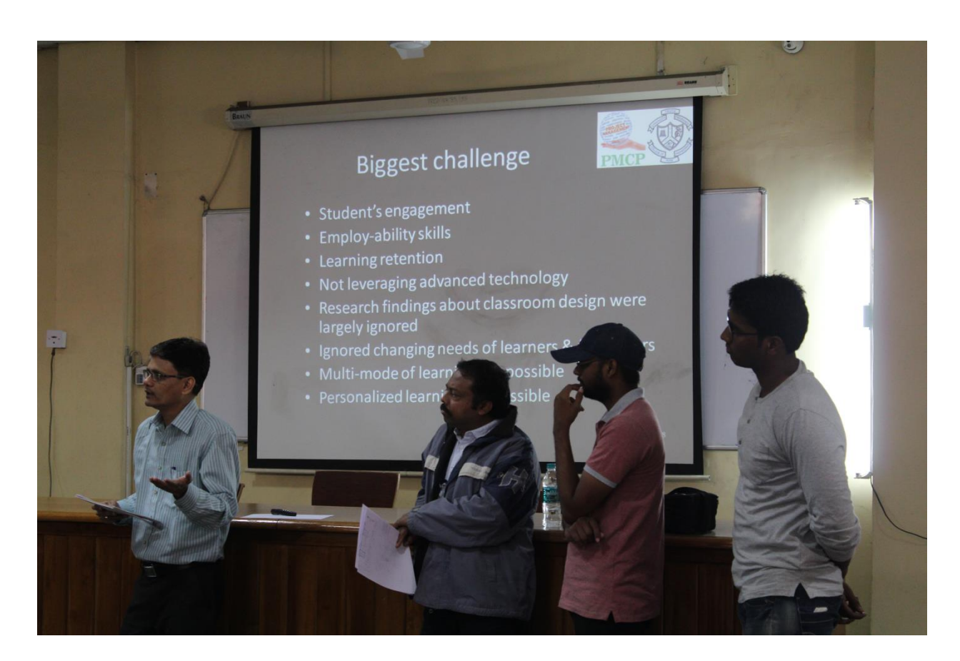
Second Team members explaining their improvised idea